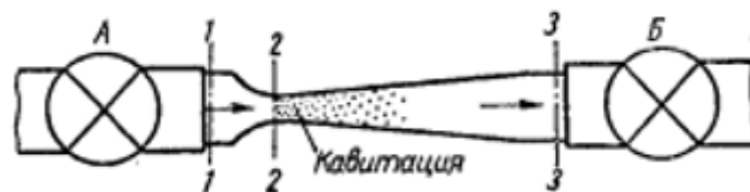
Scheme 1. The well-known scheme of the tube for demonstrations of cavitation

Cavitation is a local discontinuity in the flow with the formation of steam and gas bubbles (caverns) due to a drop in flow pressure. Such a phenomenon can be demonstrated in a simple conventional scheme 1.